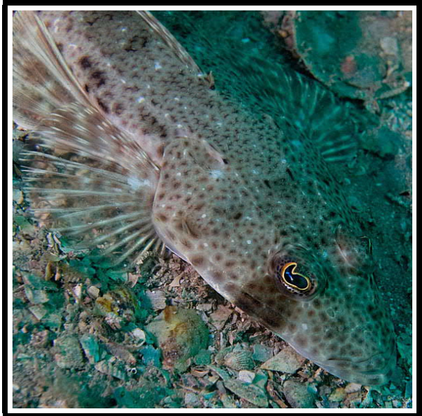
Flathead camouflaged on the sandy bottom of Port Phillip Bay