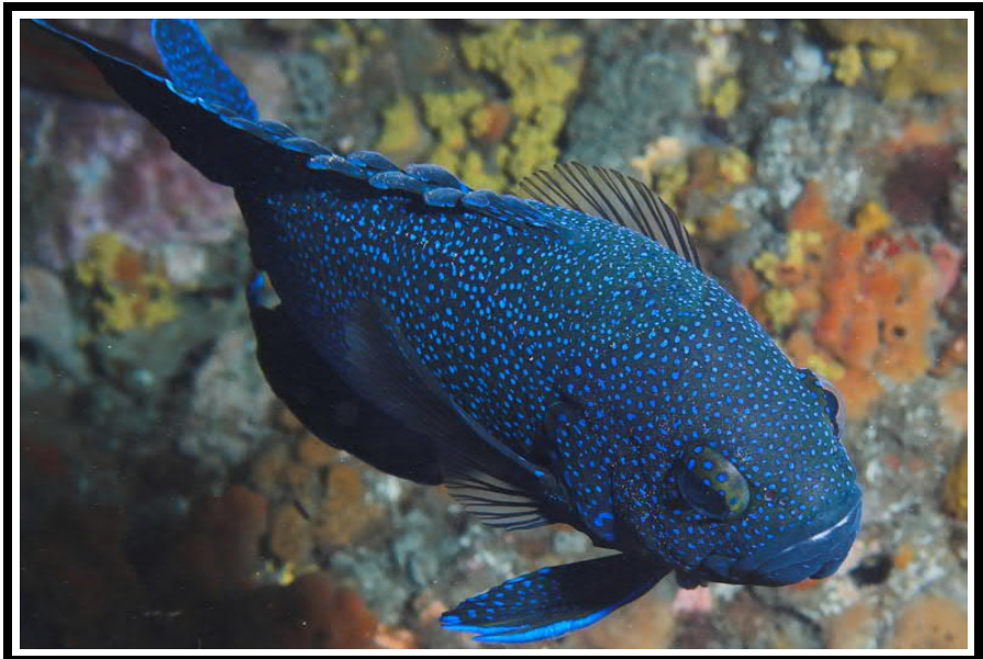
The vibrant colours of a Blue Devilfish